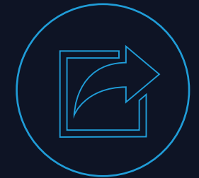
Information & Intelligence Sharing

Non-compliance to the DORA requirements may lead to a fine of up to 2% of a business' annual global turnover.