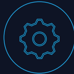
Digital Operational Resilience Testing