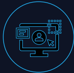
ICT Related Incident Reporting